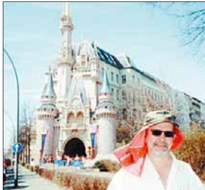
New front after rebuilding