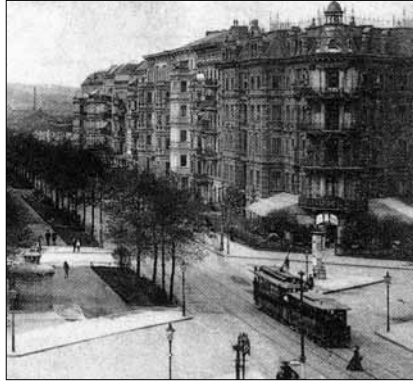
Yorkschrösschen with front garden ca. 1900