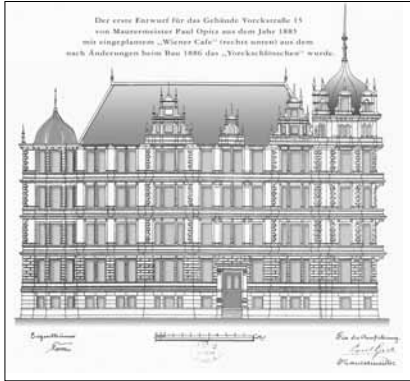
First construction drawing ca. 1885