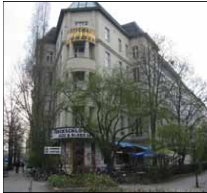
Revegetated jazz tavern with beer garden