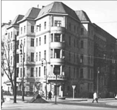
War damages: turret and stucco are gone