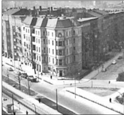
1961: no trees at the Yorkschlösschen